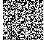
Add vContact Card

Customize and label contact details and note in 'Policyholder Name and Policy Number' from the cutout portion of ID Card below.